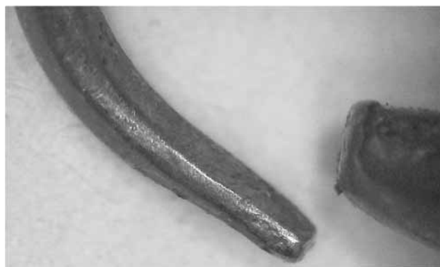
Figure 2: Both ends of earring 1742/24, with the hammer facets on the surface typical of hammering.

The five solid gold lunate-shaped earrings with a bent over the hoop are cast close to shape. The hoop is hammered to form the crooked pin (Fig. 2), and the other end is finished by polishing. The compositions of the gold alloys used in the fabrication of these five items have silver contents ranging from about 11% to 21%, and copper contents from about 1% to just over 2% (see results on Table 2). Thus, despite their stylistic and technical similarity, and internal consistency, they are made from a rather wide range of gold alloys. Interestingly, the silver to copper ratio is about 10 for all analyses. The variety of the Phoenician gold alloys was shown for the Gadir region by Ortega-Feliu et al. (2007).