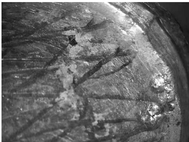
Figure 4: The bezel of gold signet finger-ring 1742/1476: the internal surfaces of the bezels are scratched.

It is of course possible that the copper was added intentionally; the effects of even small amounts of copper on hardness are relatively high, due to the c 12% difference in atomic radii between gold and copper (Hough et al. , 2009), while the effect on the colour is probably too low to have