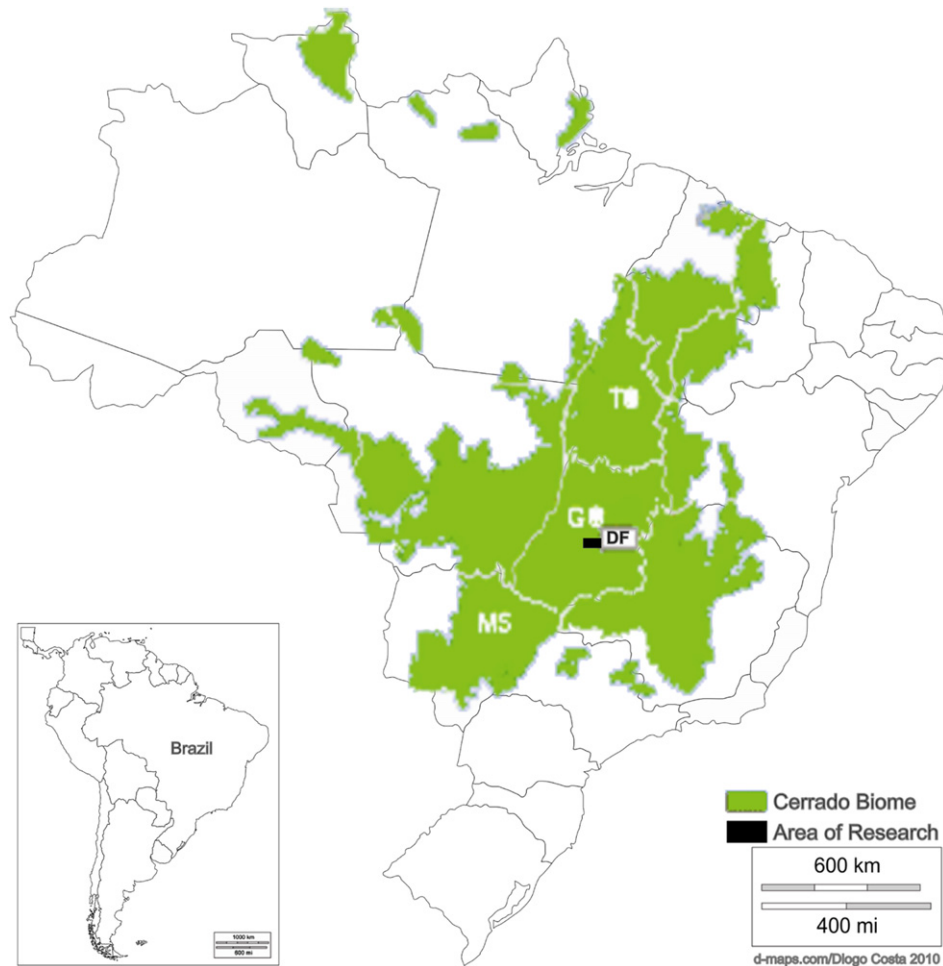
Fig. 1. Cerrado biome.

the latosols or oxisols 1 tend to have good physical but poor chemical properties. The good physical properties are mainly due to high aggregate stability, while the poor chemical properties are low nutrients, such as phosphorus and calcium, and low micronutrients. Most of the Cerrado is located on large plateaus, broken by a network of depressions and river valleys. Several of South America's major rivers, such as the São Francisco , Tocantins , Araguaia , Xingu , and Paraguay rivers, have headwaters in the Cerrado area.