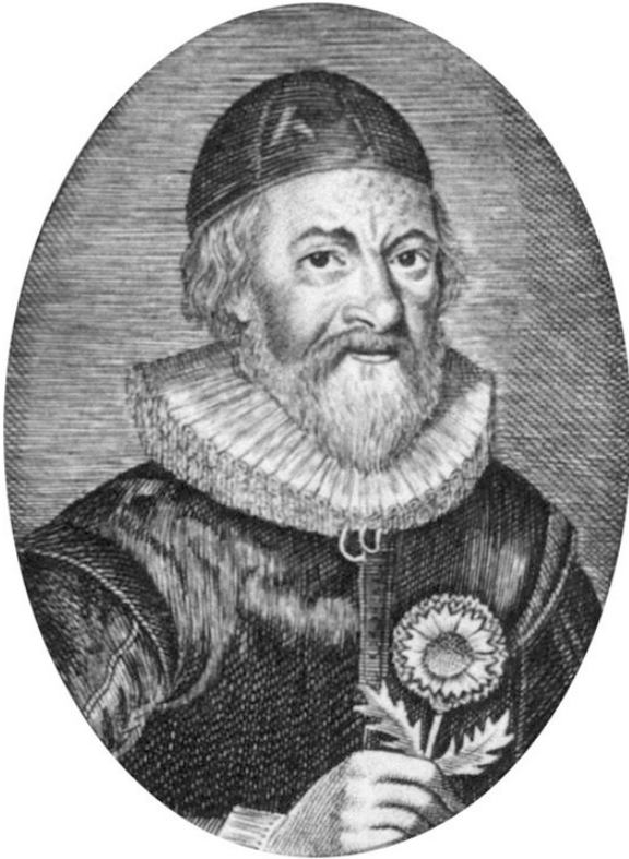
Figure 1. John Parkinson (1567–1650). The first person to document the use of moulds to treat infections.

got there before him. In 1870, Sir John Scott Burdon-Sanderson (1828–1905) described how culture fluid covered in mould inhibited the growth of bacteria. The year after, Joseph Lister (1827–1912) experimented with ' Penicillium glaucium ' (sic), demonstrating that it had an antibacterial effect on human tissues, and in 1875, Dr John Tyndall (1820–1893) presented his experiments with Penicillium notatum to the Royal Society. Finally, in 1897, Ernest Duchesne (1874–1912) observed Arab stable boys treating saddle sores with mould propagated on their saddles. He took this mould, confirmed as Penicillium notatum , and used it to successfully treat induced typhoid in guinea pigs. 3