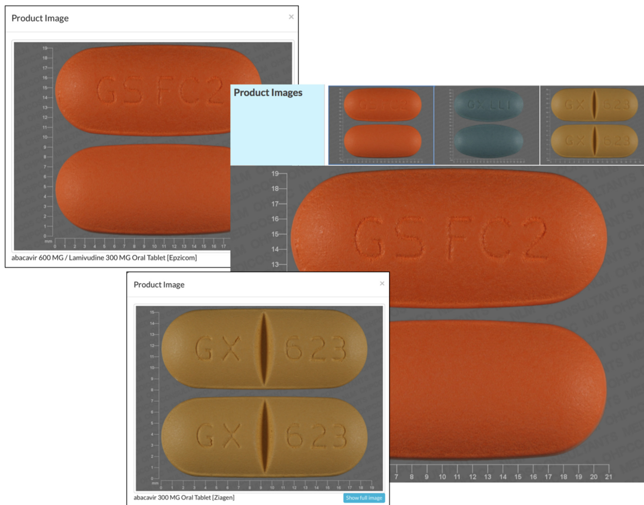
Figure 1. A screenshot montage of DrugBank's new pill images.

ing tools. Previously, static PDF images or relatively crude 'stick' spectrum renderings were the norm for most of DrugBank's spectral data. With DrugBank 5.0 all MS and NMR spectra are now viewable with JSpectraViewer, a locally developed JavaScript spectral viewing tool that is able to read and render nmrML and mzML formatted spectra. For NMR spectra, JSpectraViewer allows users to interactively hover over spectral peaks and to see ^1\text{H} spectral assignments and the corresponding protons on a rendered image of the molecule. For MS spectra, JSpectraViewer allows users to interactively hover over spectral peaks and to see the structures of the fragment ions that are predicted (via CFM-ID) to correspond to the observed m/z value. Screenshots of DrugBank's new spectral viewing tools are shown in Figure 2.