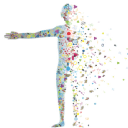
Human metabolome project

The metabolome refers to the complete set of small-molecule (<1.5 kDa) [25] metabolites (such as metabolic intermediates, hormones and other signaling molecules, and secondary metabolites) to be found within a biological sample, such as a single organism. [26][27] The word was coined in analogy with transcriptomics and proteomics ; like the transcriptome and the proteome, the metabolome is dynamic, changing from second to second. Although the metabolome can be defined readily enough, it is not currently possible to analyse the entire range of metabolites by a single analytical method.