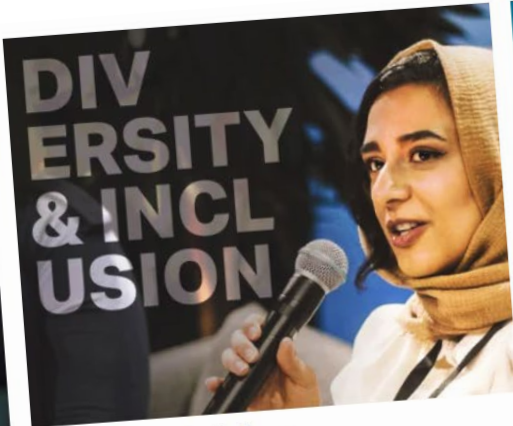
Advancing gender balance