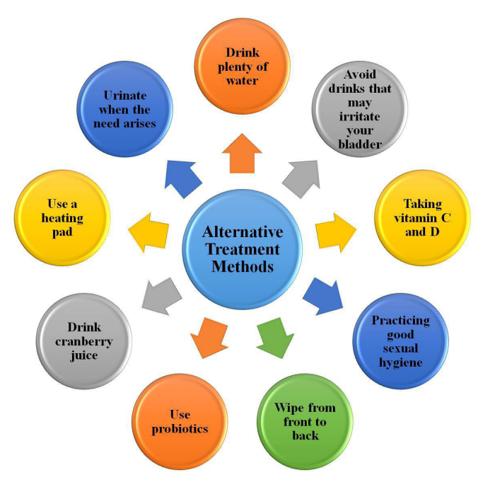
Figure 2 Alternative methods used to treat minor urinary tract infections.

to speed up the recovery process as an alternative to antibiotics (figure 2). Staying hydrated, that is, drinking plenty of water and avoiding drinks that irritate the urinary bladder (such as alcohol and caffeinated drinks) can help in preventing and treating UTIs. Water helps in removing waste from the body, while retaining essential nutrients and electrolytes needed by the body. Drinking enough water dilutes the urine and speeds up its way through