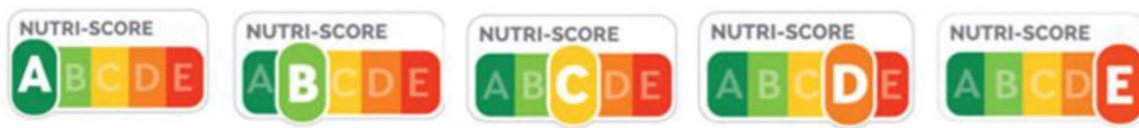
Fig. 1 The Nutri-Score labelling system. This system is a summary, colour-coded, graded FOP label that shows a scale of five colours, from dark green to red. The Nutri-Score system combines positive characteristics (i.e., fruit, vegetables and nuts, fibre, protein and seed, walnut and olive oils content) with negative characteristics

(i.e., energy, total sugar, saturated fatty acids and sodium content) to achieve a score between -15 (most healthy) and +40 (least healthy). As shown, this score is reduced to a combination of a letter (A to E), where A reflects the highest nutritional quality and E the lowest